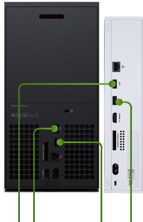
USB type-A1 (10Gbps)