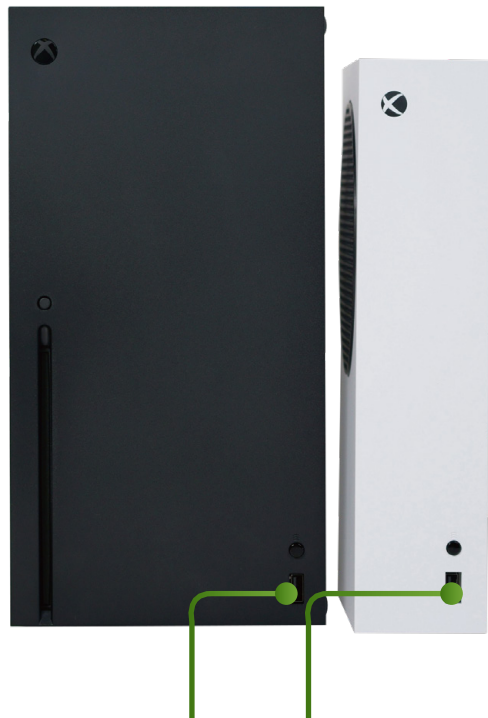
USB type-A0 (10Gbps)