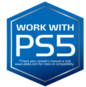
PS5 M.2 SSD SLOT VIEW