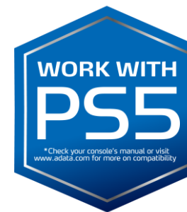
PS5 M.2 SSD SLOT VIEW